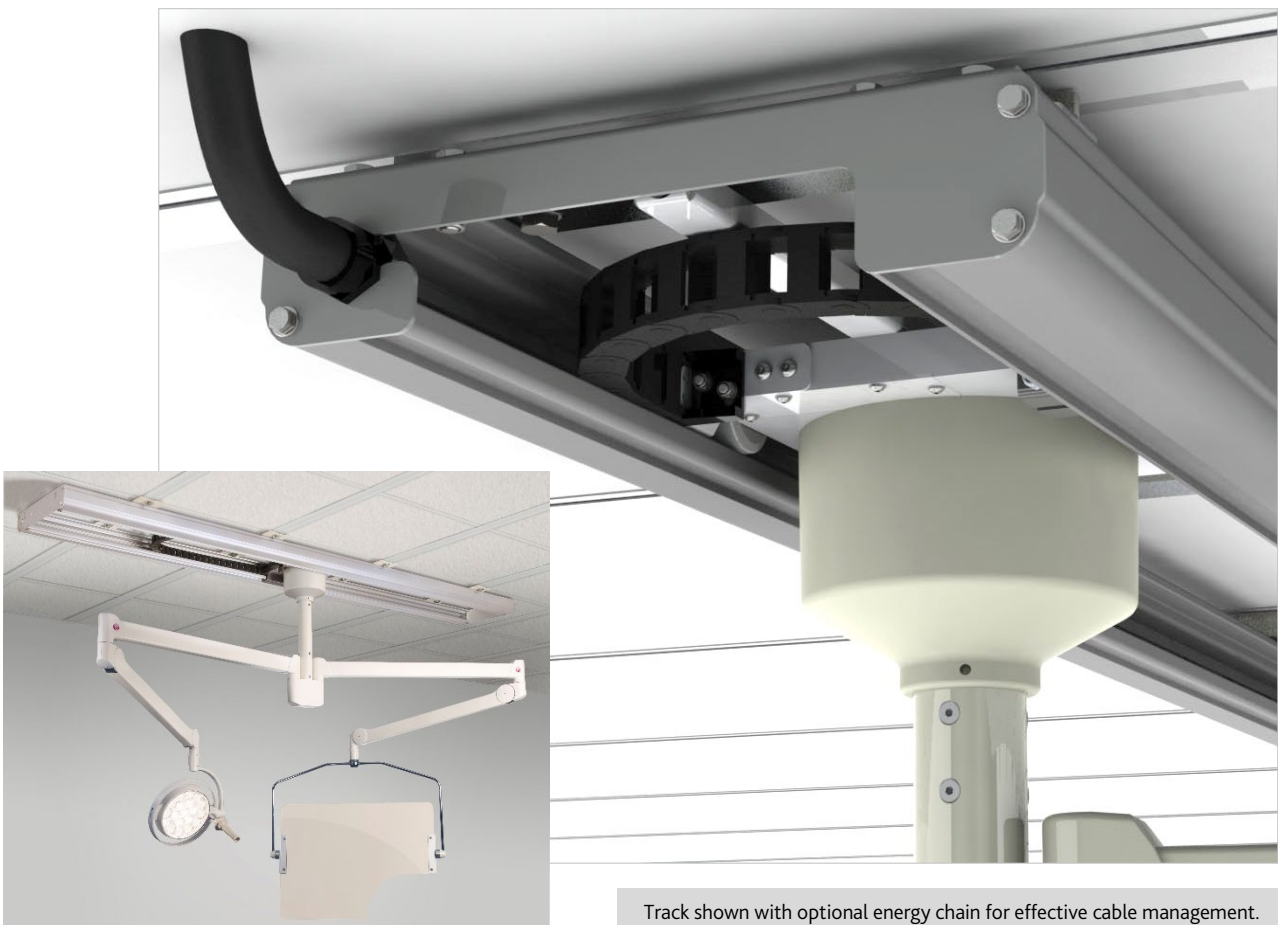
Track shown with optional energy chain for effective cable management. #3001/TC/250/EC for 2.5m track. #3001/TC/420/EC for 4.2m track.

The Kenex range of aluminium ceiling tracks provide strong and easy to install systems for suspending radiation shields, surgical lights and other suspended medical equipment.