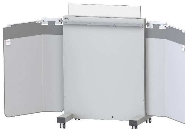
Model 310/B-3 plus 2 x model 317/05-01 (total width: 214 cm)