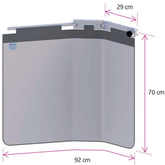
312/E-010 Weight: 7.2 kg

Weights and dimensions are subject to manufacturing tolerance