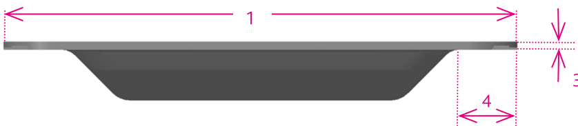
End view of table