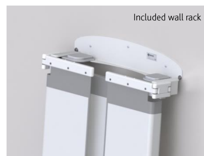
Included wall rack