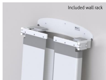
Included wall rack