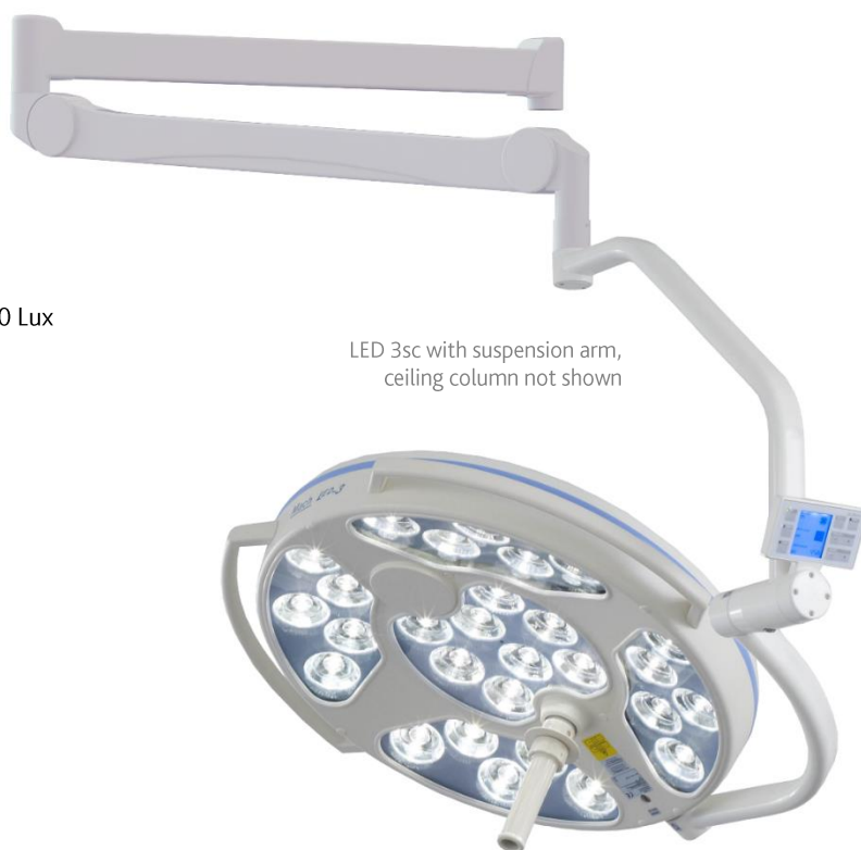
LED 3sc with suspension arm, ceiling column not shown

Model 360/530/03 is supplied with a two part suspension arm allowing versatile movement, and mounts onto the supplied 80cm long ceiling column (other lengths available). The ceiling column can be attached to a load bearing or suspended ceiling (different installation aids are available to suit differing site conditions – see over). Alternatively, a ceiling column can be directly attached to the movable carriage of a 2.5m or 4.2m ceiling track (available separately) with lamp cables contained and managed within a separately supplied flexible energy chain. These options enable the complete assembly to move into and out of the working area as required.