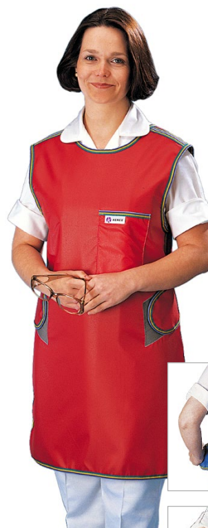
Model 909 Pocket 900/001 shown as an optional extra