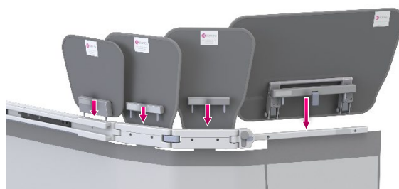
Rear of shield – showing how optional tops attach